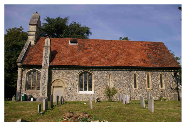
An unusual view from the South

Why not read the full story on the village website www.birchanger.com